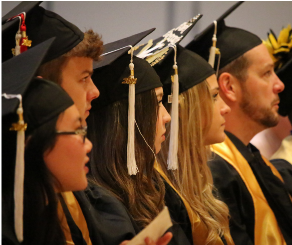
Over 450 students graduate from CMCI each year as enrollment continues to grow.