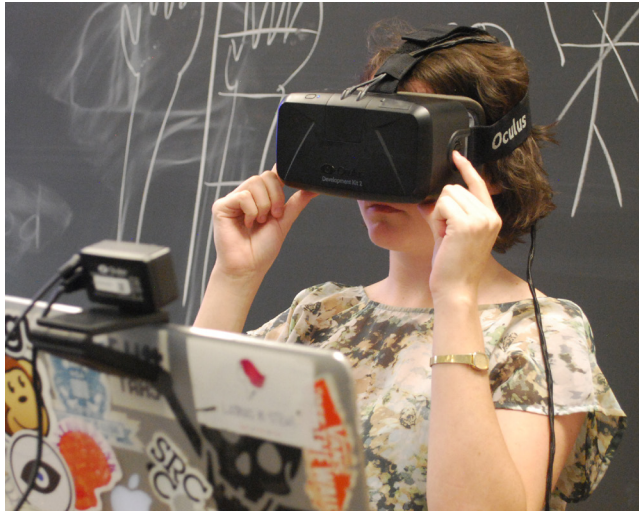
A student experiments with a virtual reality headset during a summer session on emerging technologies in journalism.